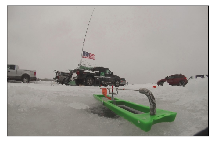
Ice Station ZZL , February 10th 2019