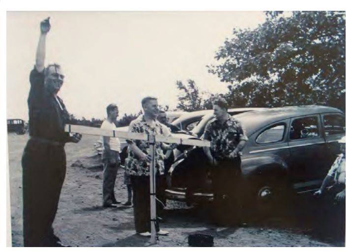
Photos (above & below) of ARAC Field Day at Park Point-1947 or 1948

"Field Day is a picnic, a campout, practice for emergencies, an informal contest and, most of all, FUN! It is a time where many aspects of Amateur Radio come together to highlight our many roles."